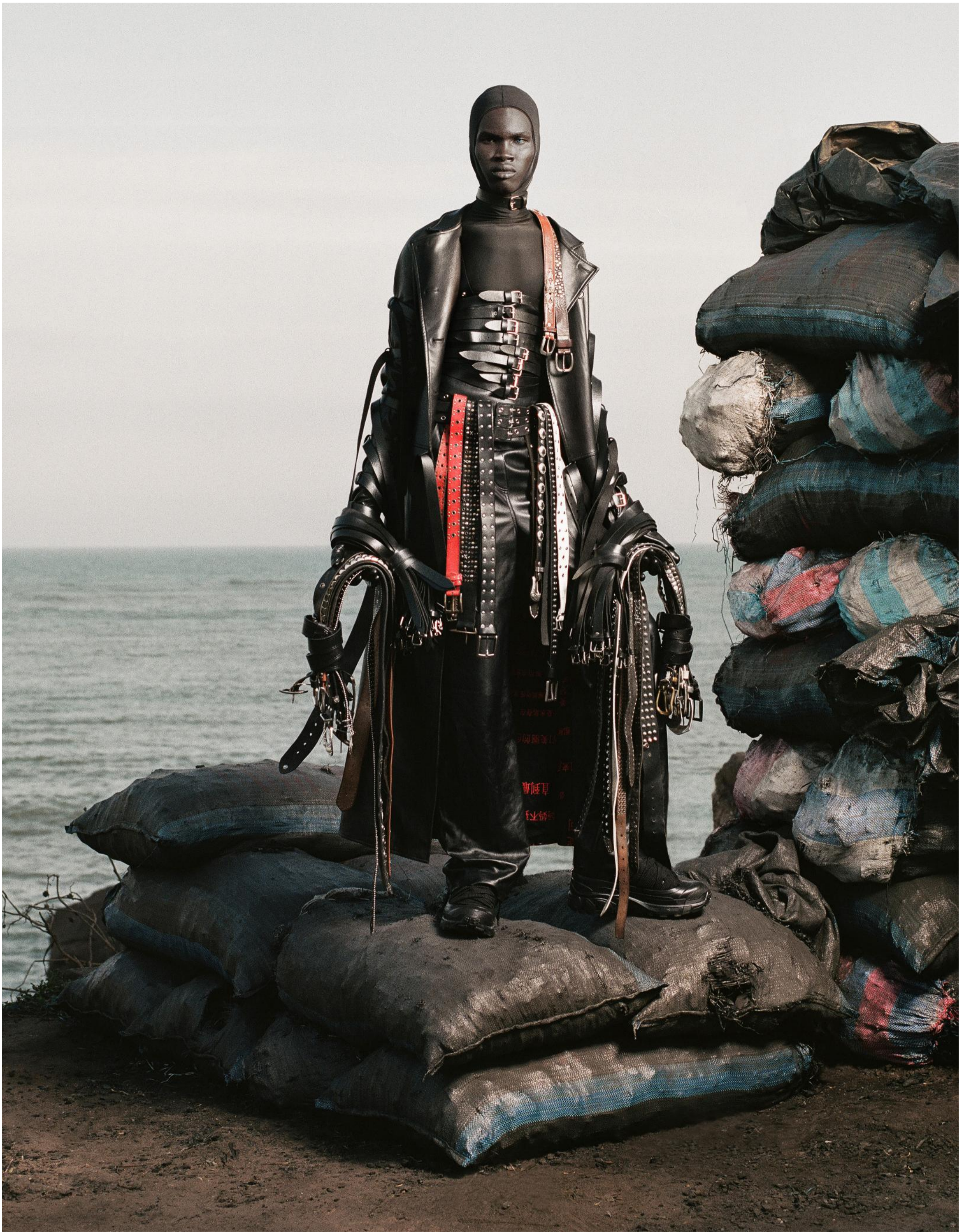
29. BEACH SELLER - NUMERO