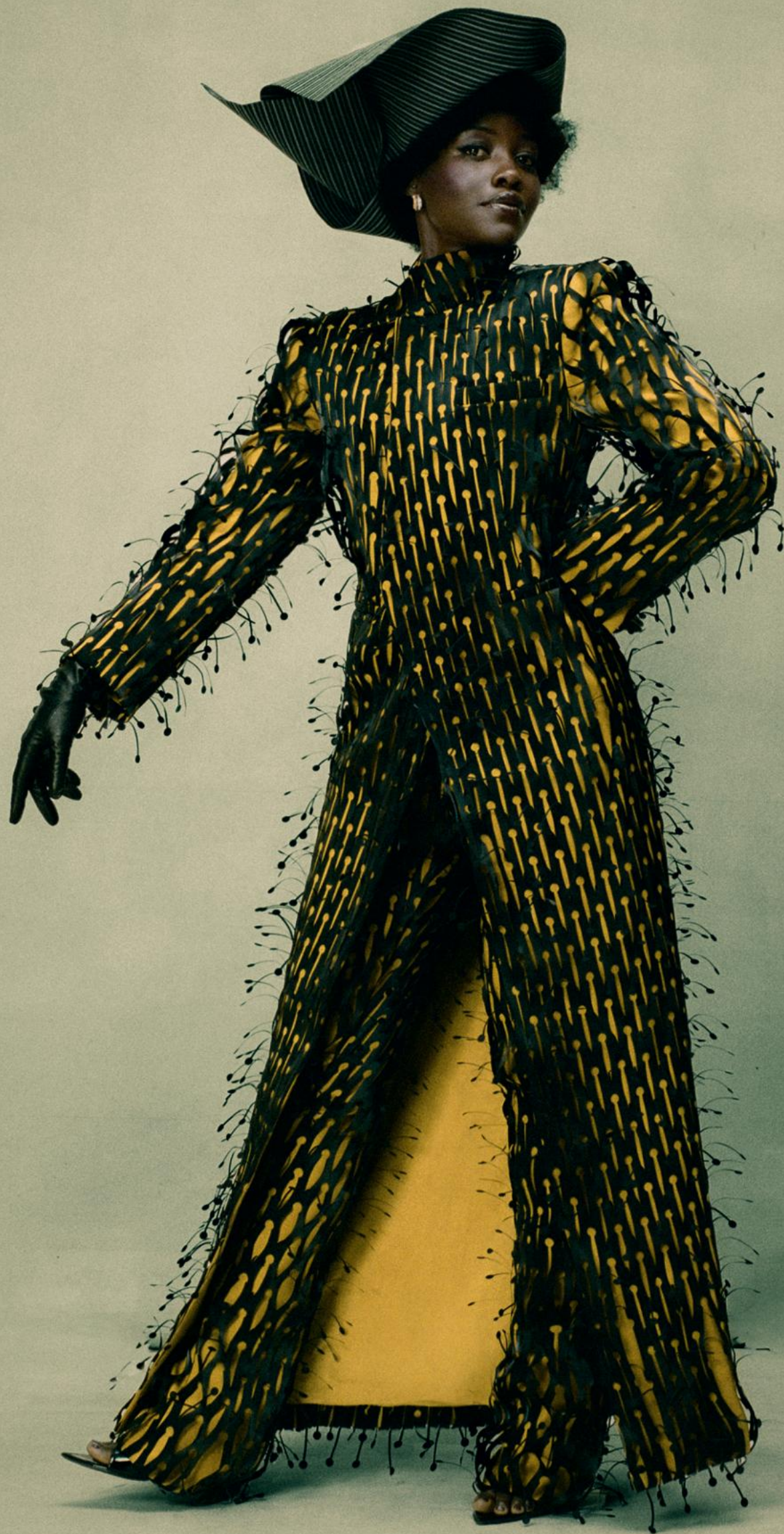
LUPITA NYONG'O- WWW