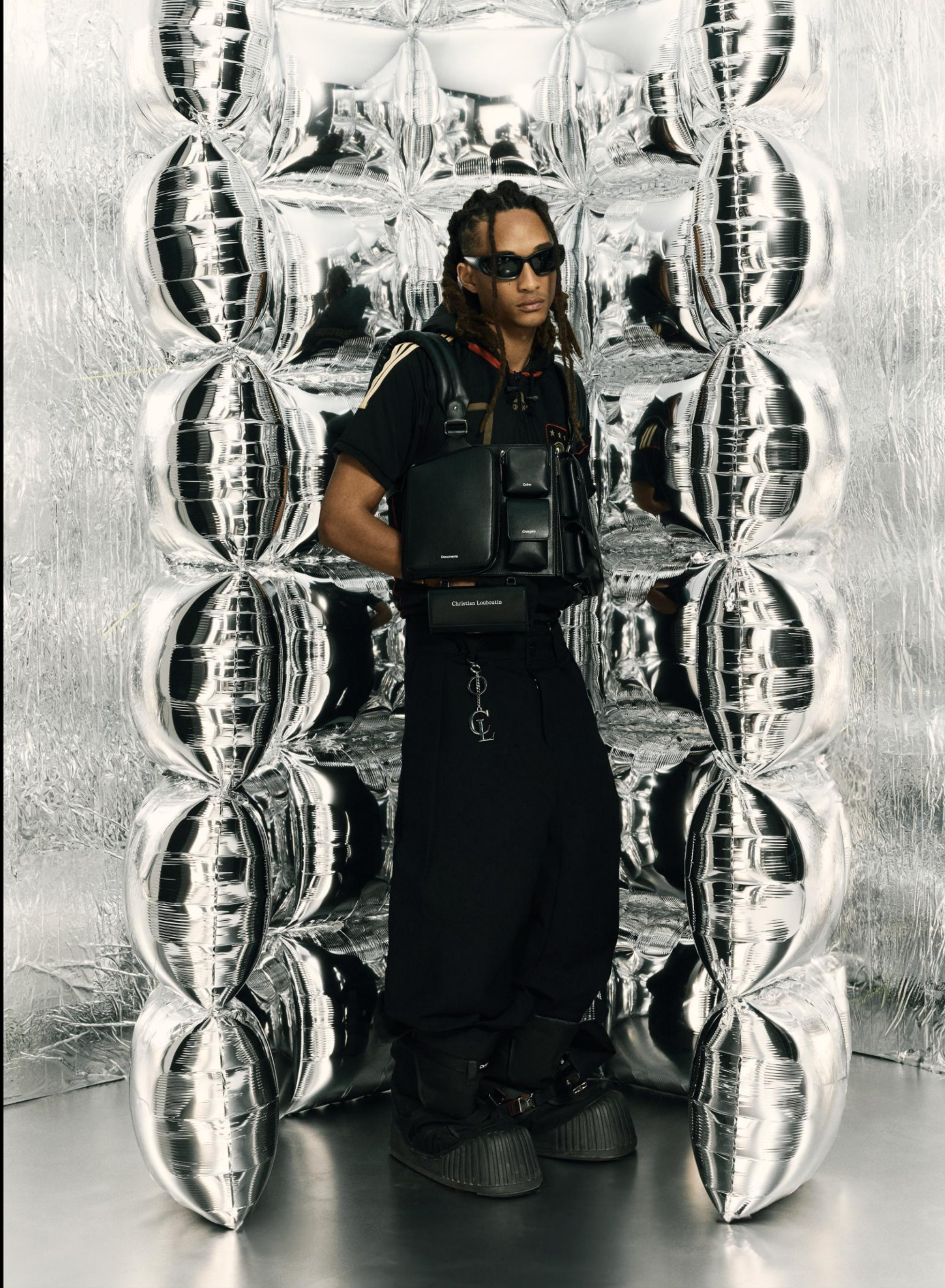
JADEN SMITH - BRITISH GQ