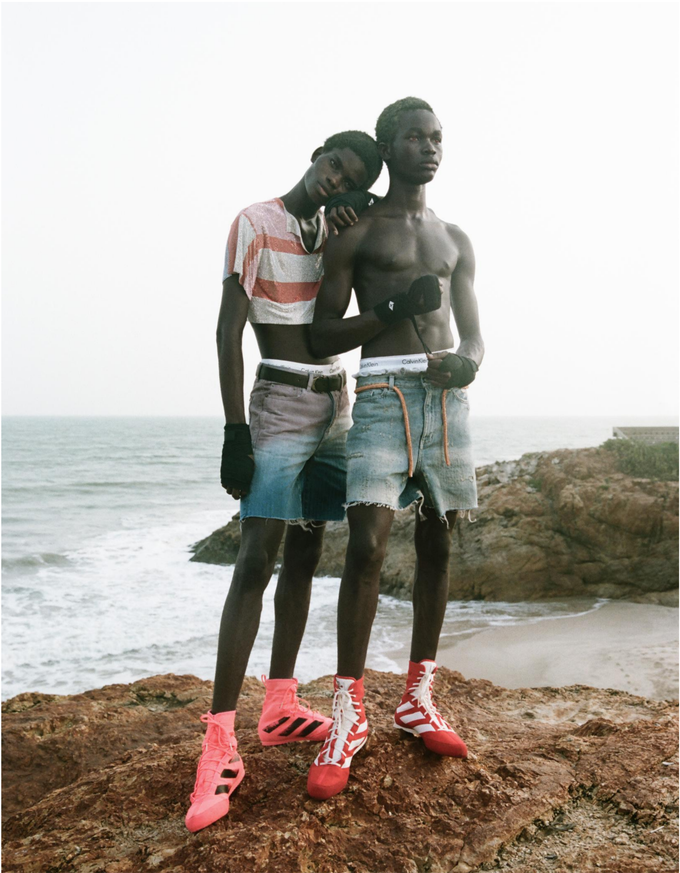
30. ACCRA'S BOXING - HIGHSNOBIETY