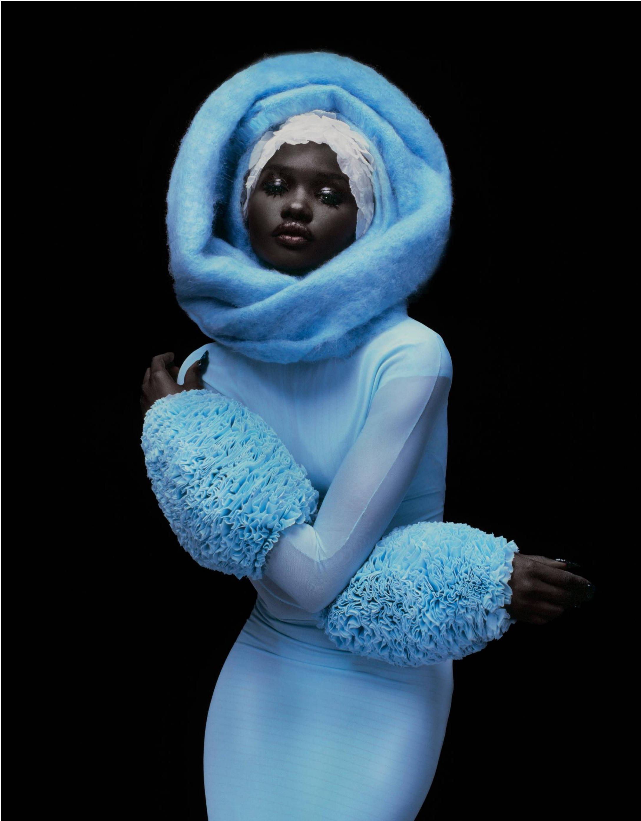
10. FLORA - AKON CHANGKOU - NUMERO