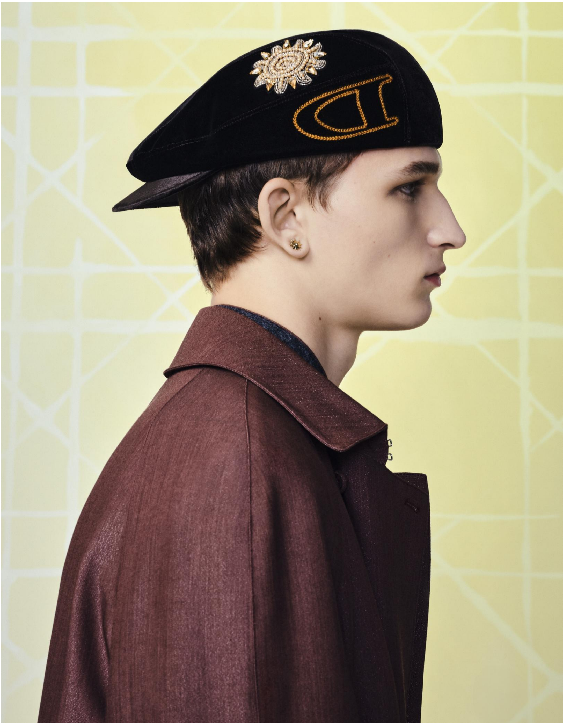
47. DIOR - LEWIS HAMILTON