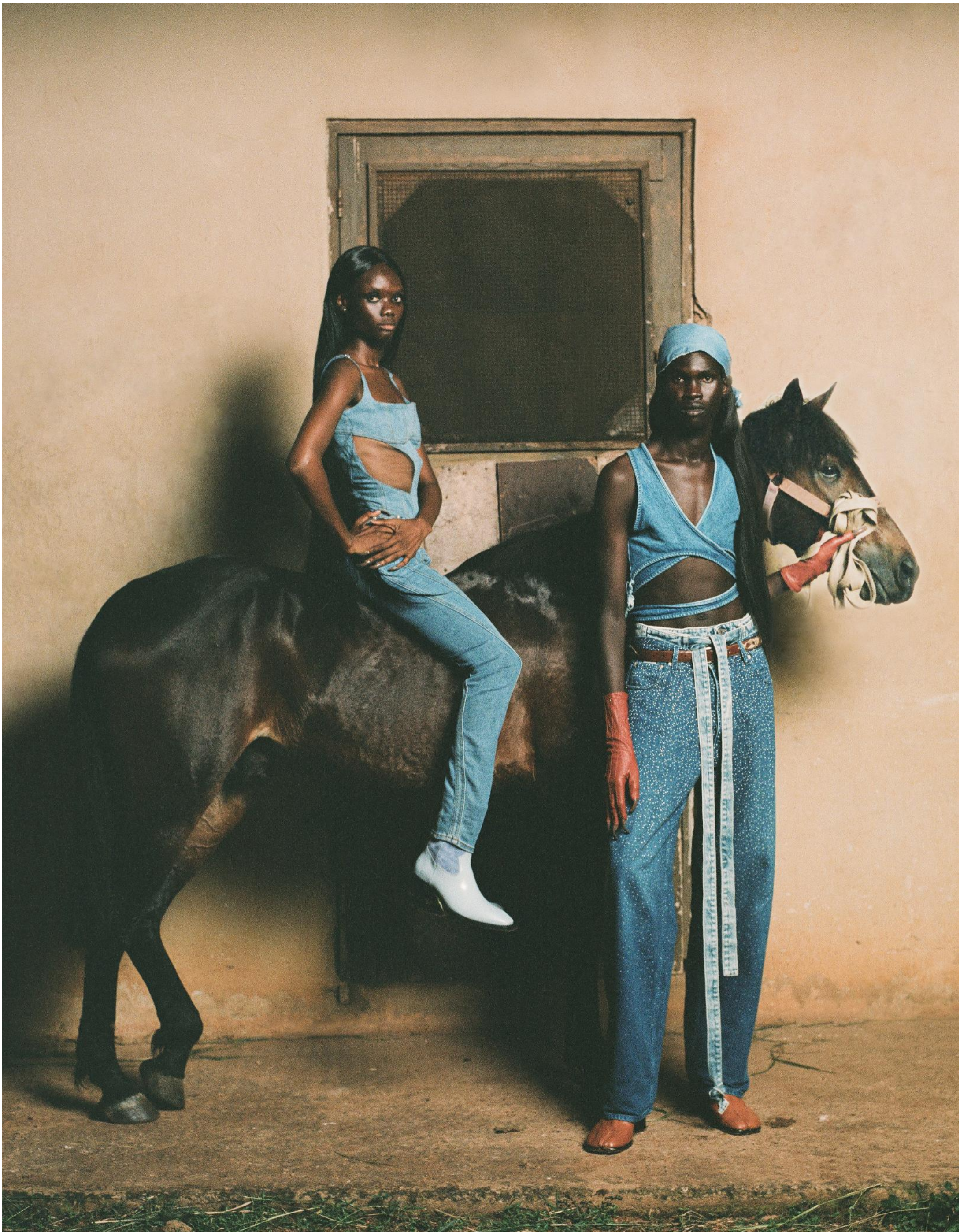
20. GHANIAN COWBOY - SSENSE