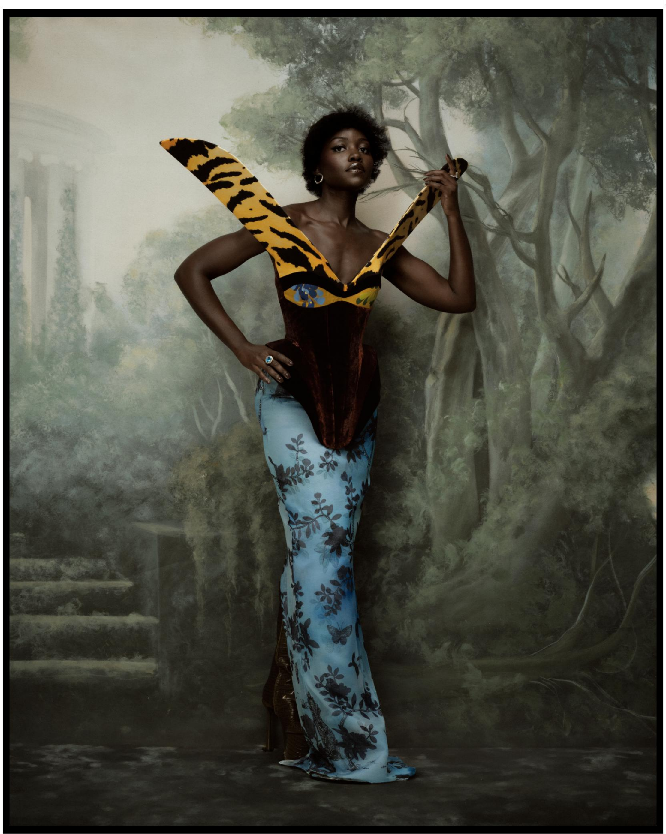
LUPITA NYONG'O - WW