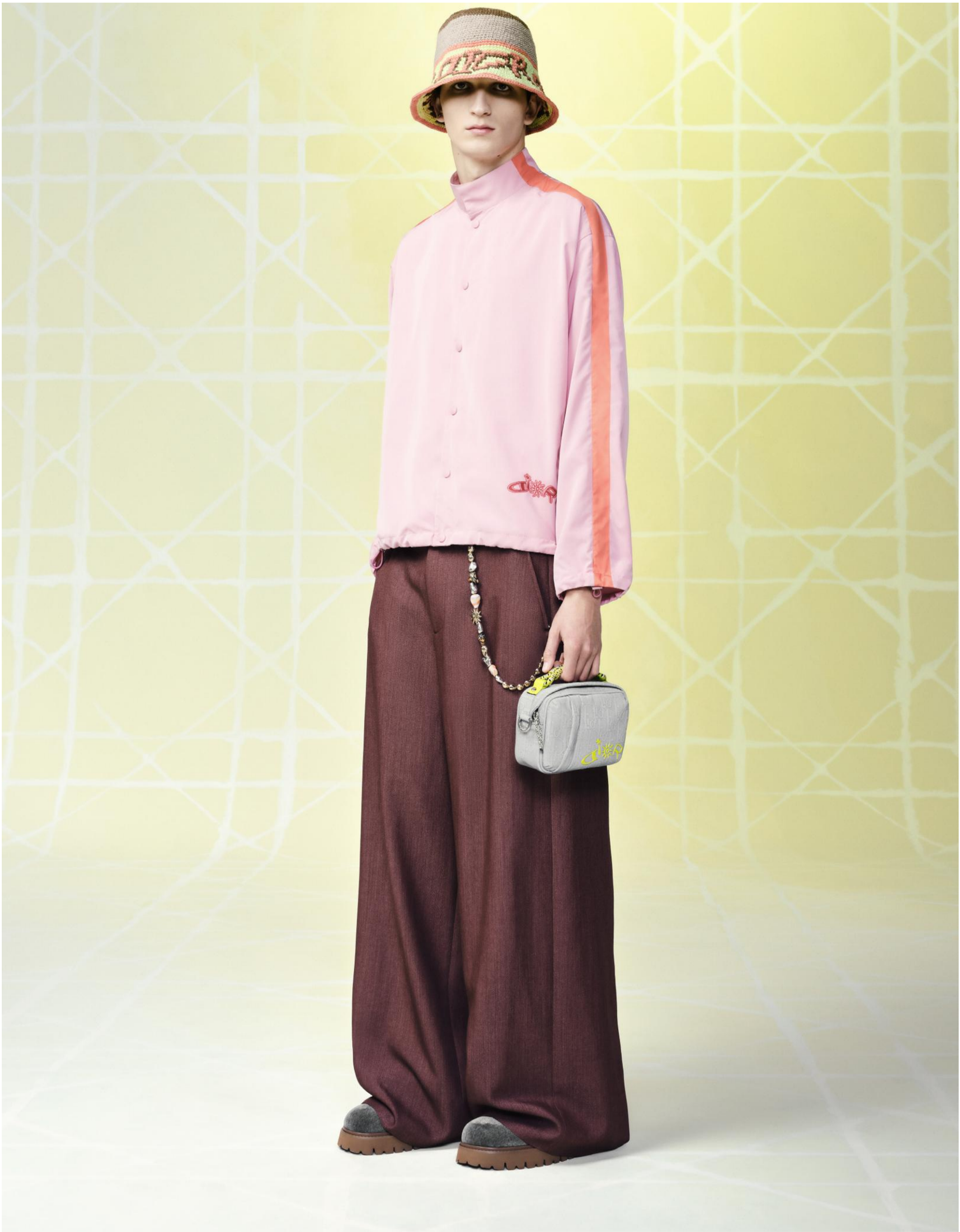
48. DIOR - LEWIS HAMILTON