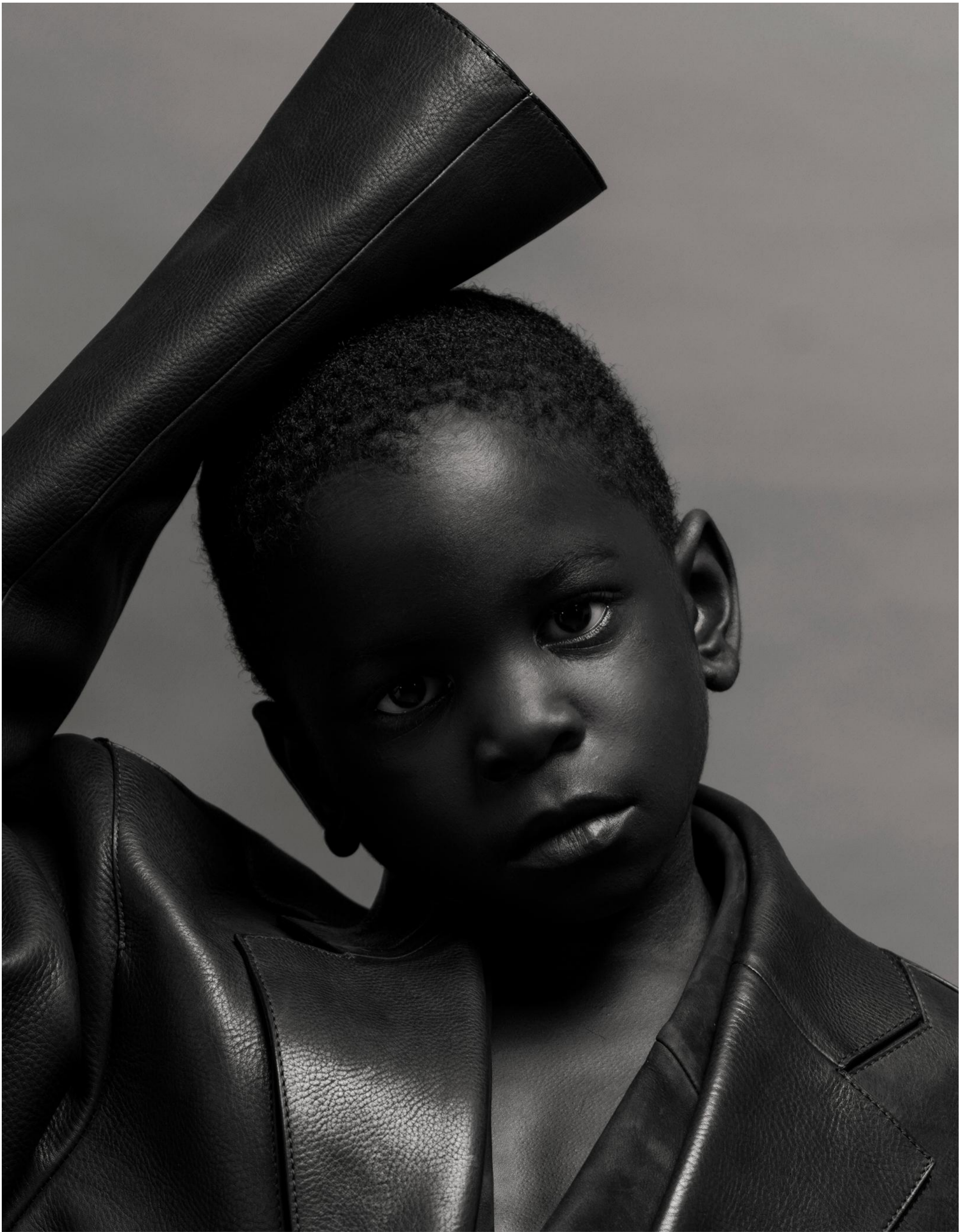
34. THE GODFATHER - CHERITHA - HIGHSNOBIETY