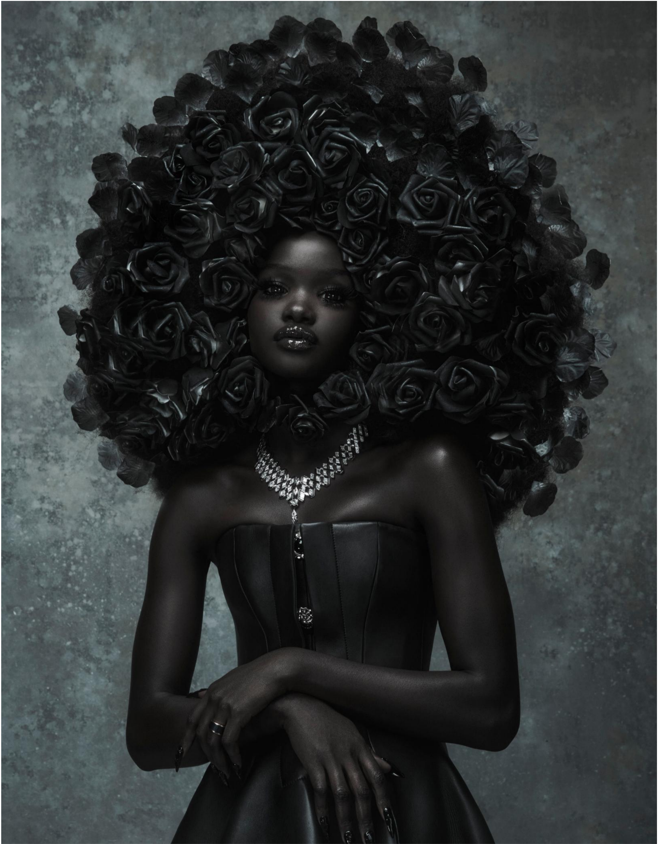
05. FLORA - AKON CHANGKOU - NUMERO