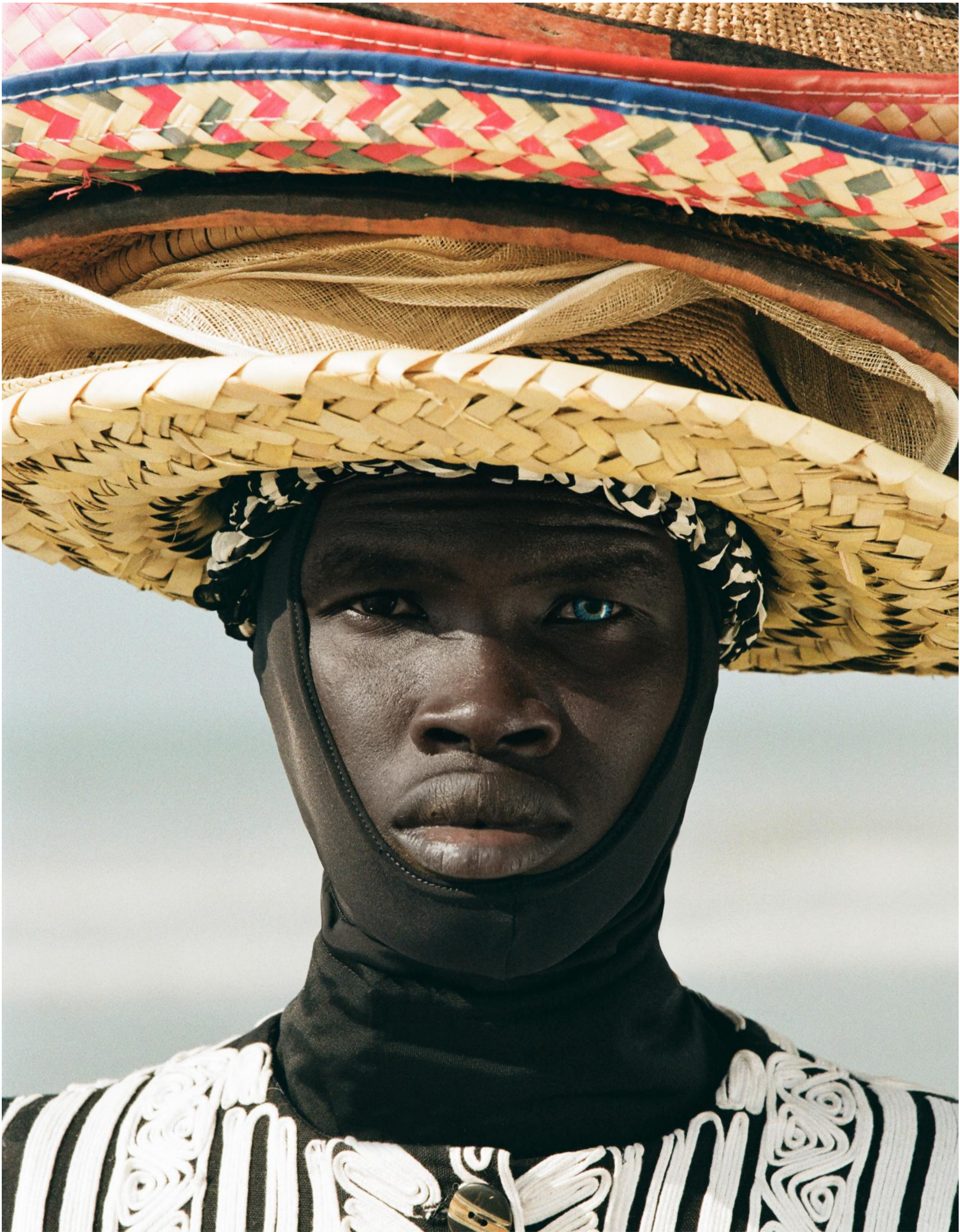
28. BEACH SELLER - NUMERO