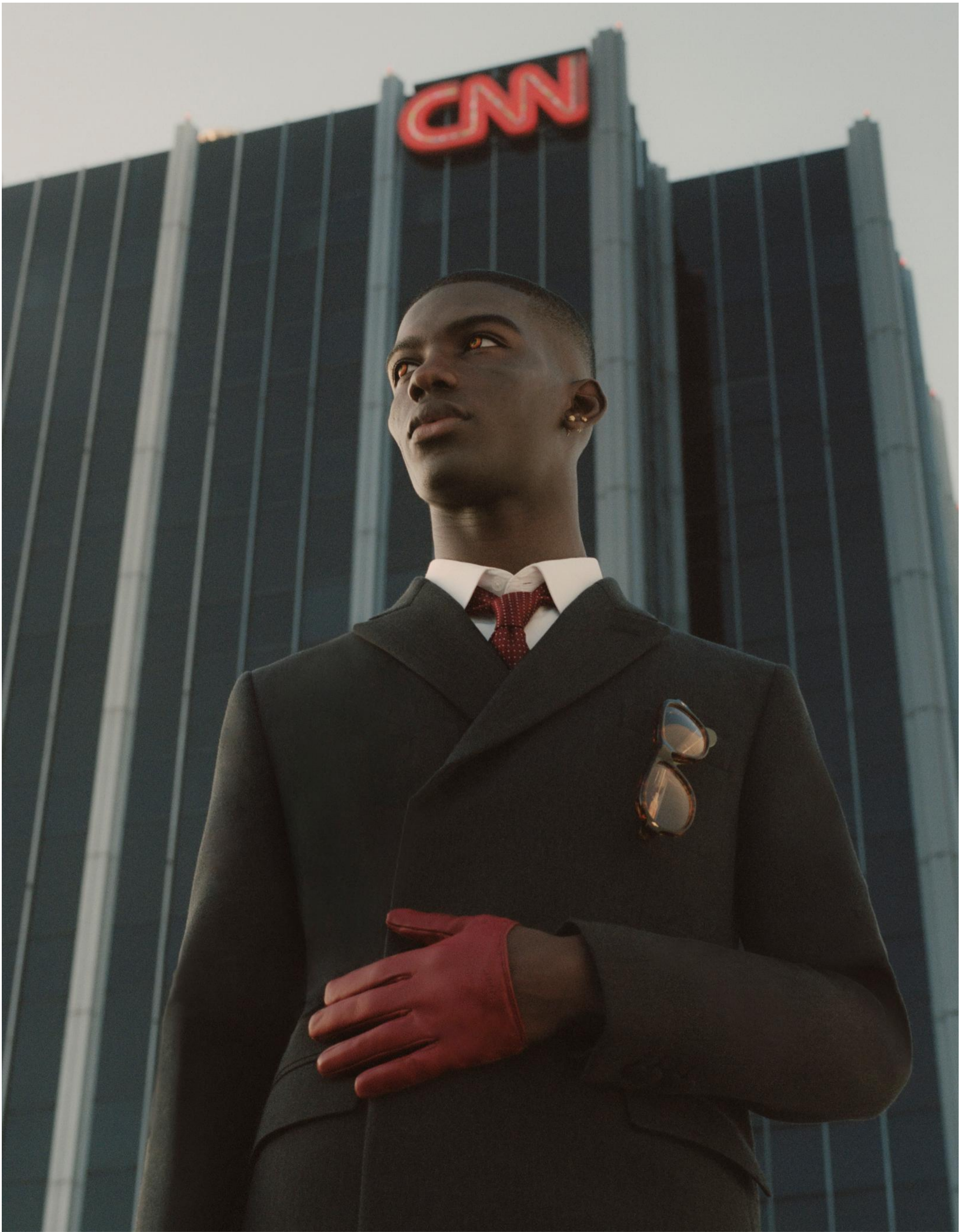
19. ALIEN PART II - NUMERO