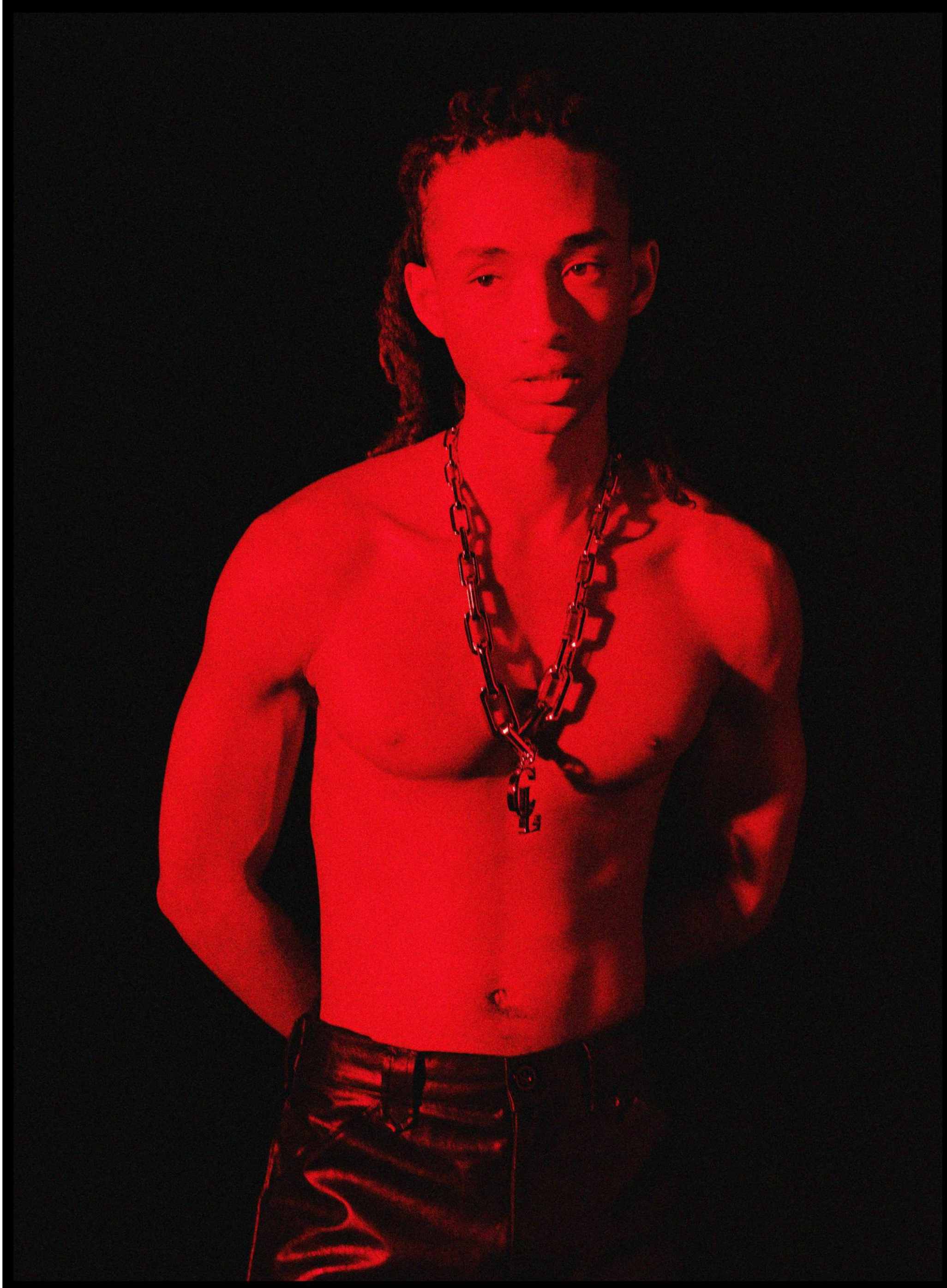
JADEN SMITH - BRITISH GQ