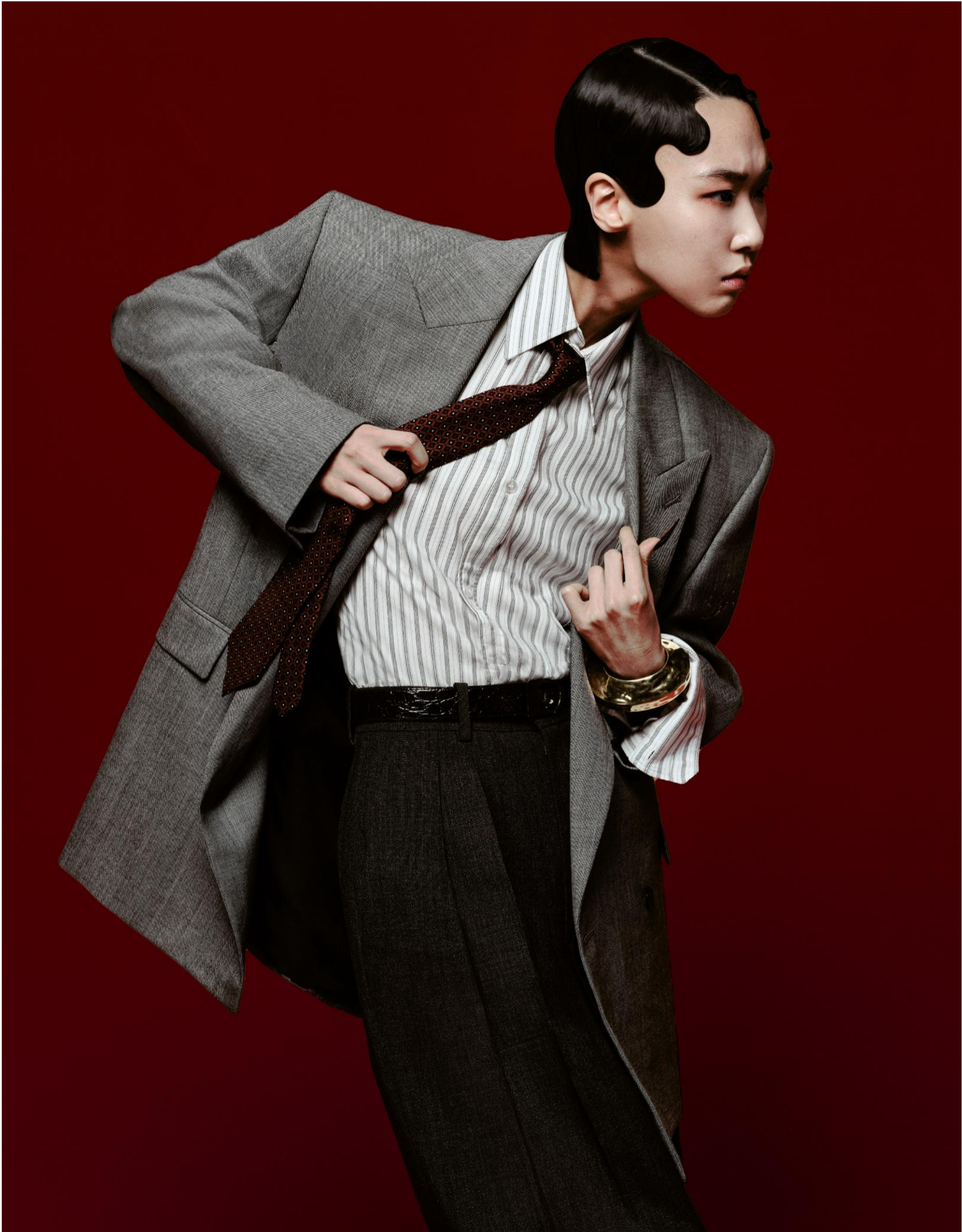
08. THE CURSE - NUMERO