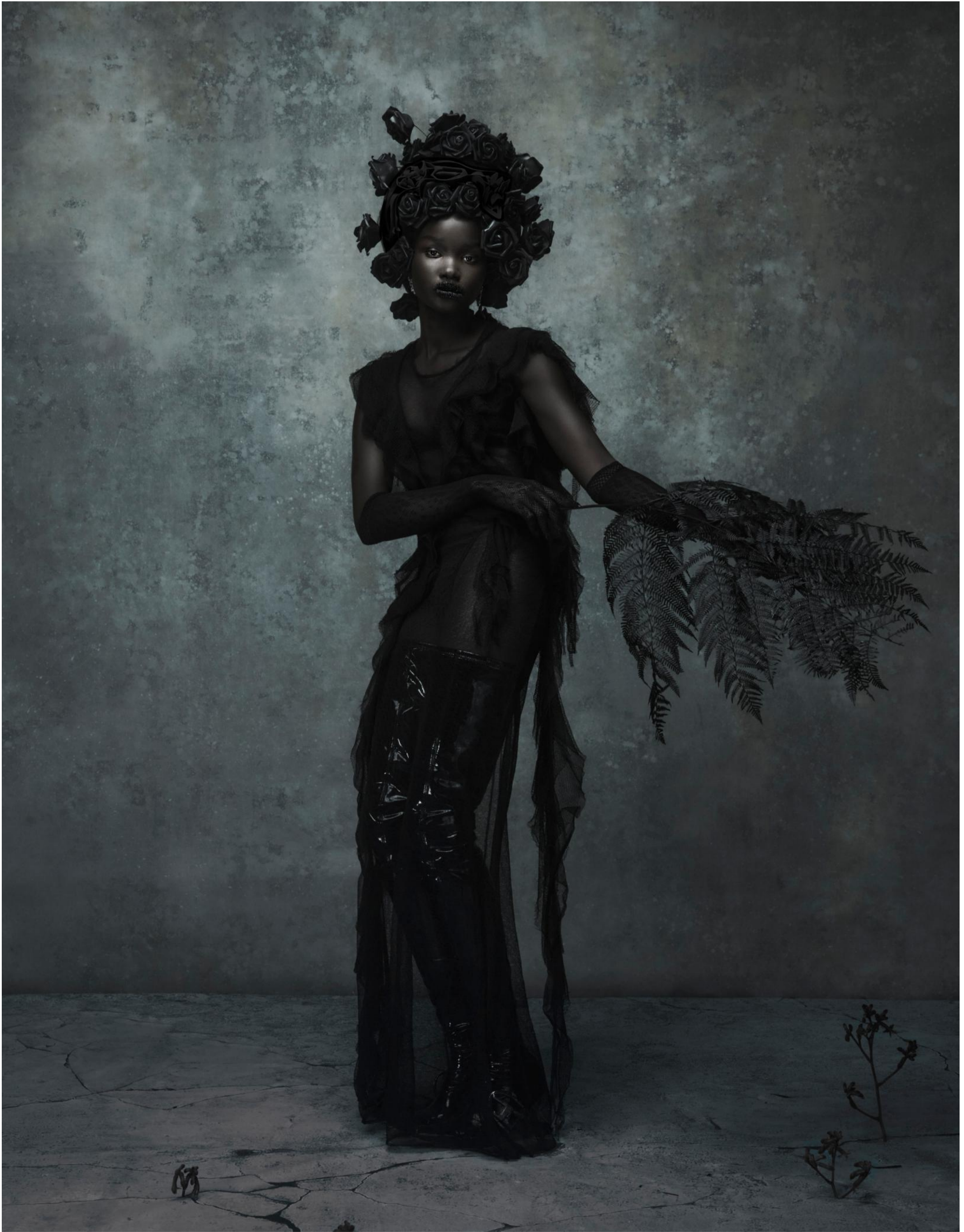
38. FLORA - NUMERO MAGAZINE