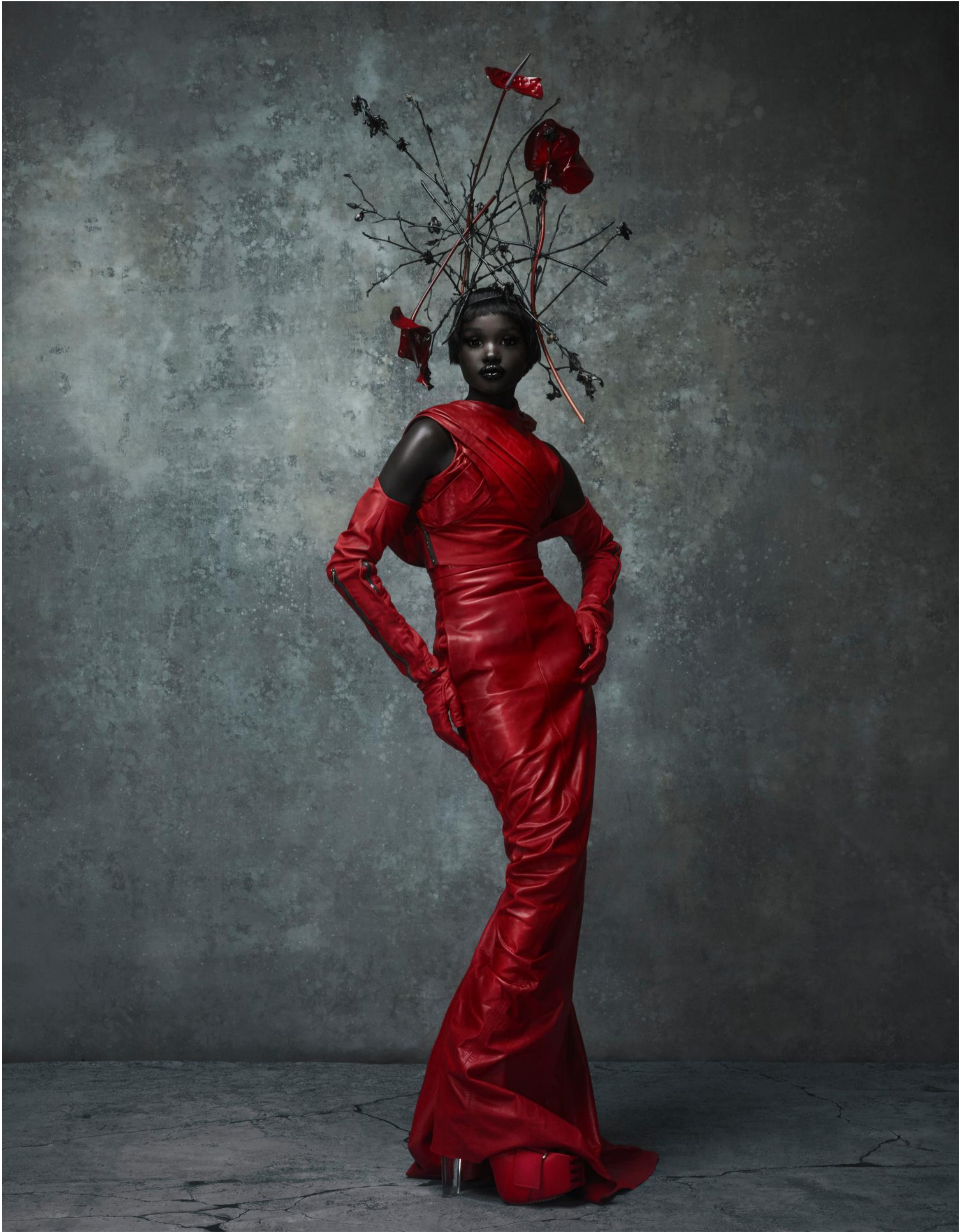
11. FLORA - AKON CHANGKOU - NUMERO