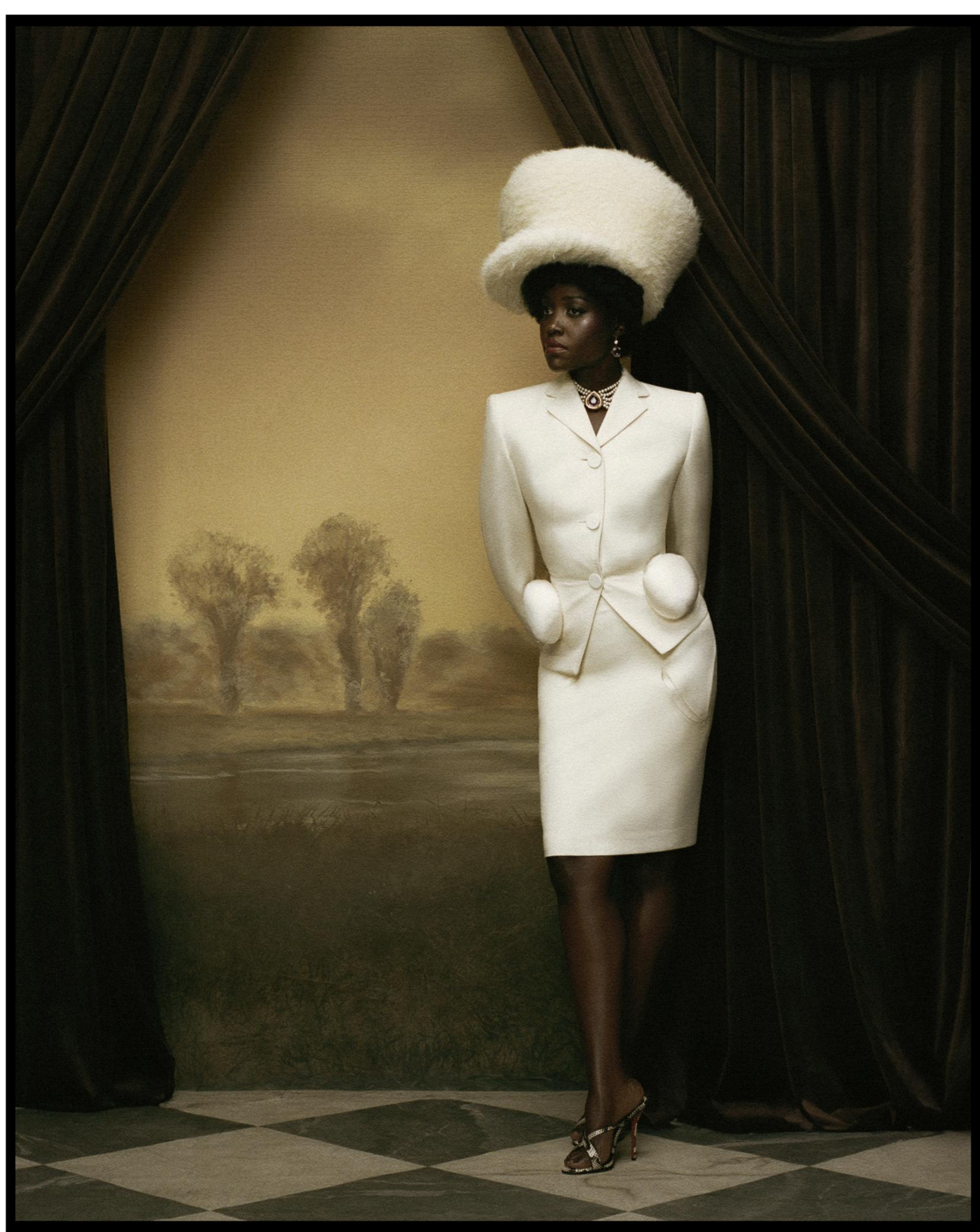
LUPITA NYONG'O- WW