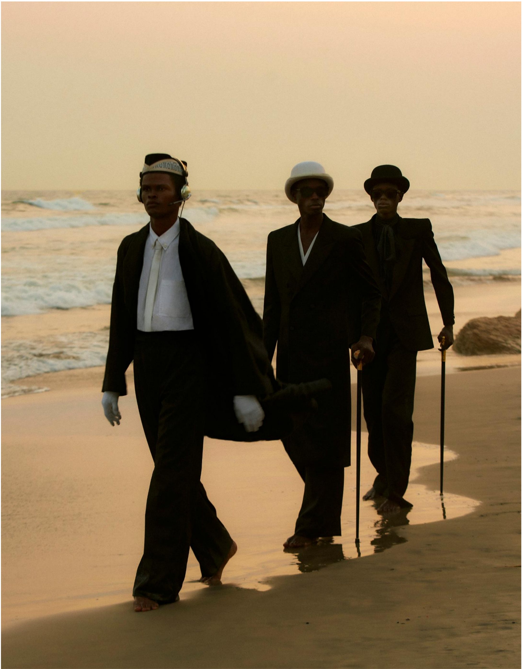
12. THE FUNERAL - NUMERO MAGAZINE