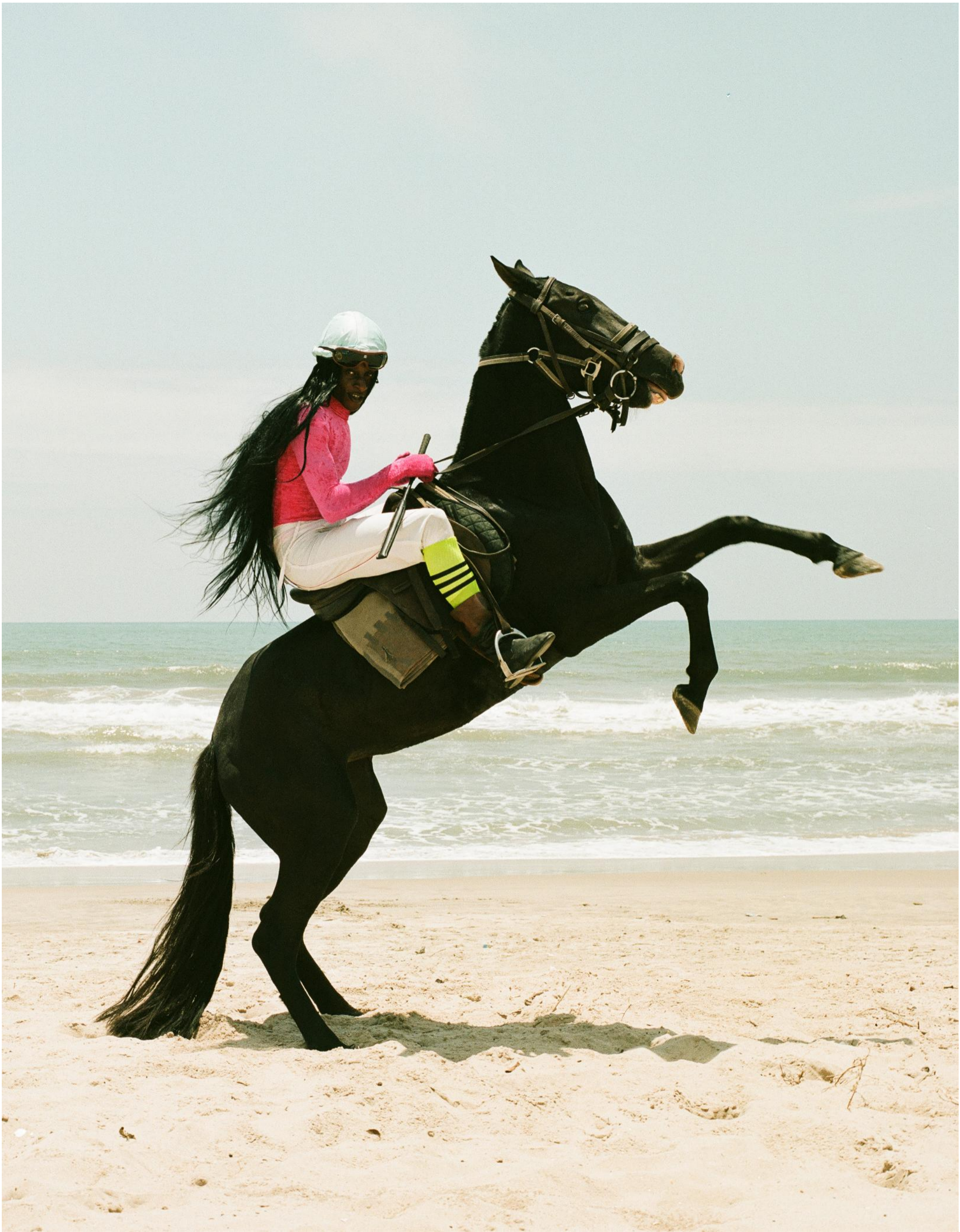
31. GHANIAN COWBOY - SSENSE