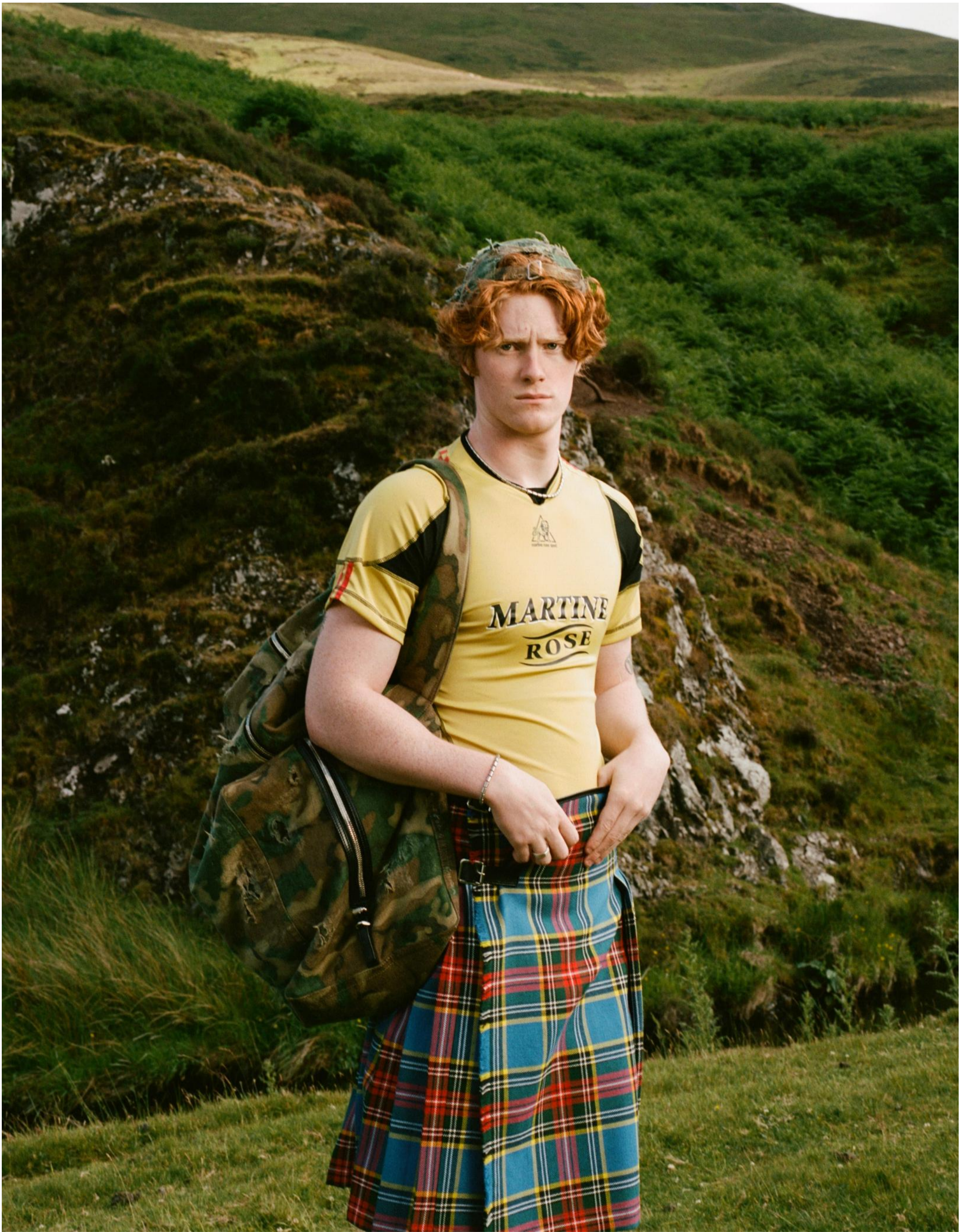
14. SCOTTISH DRILL - NUMERO 15. SCOTTISH DRILL - NUMERO