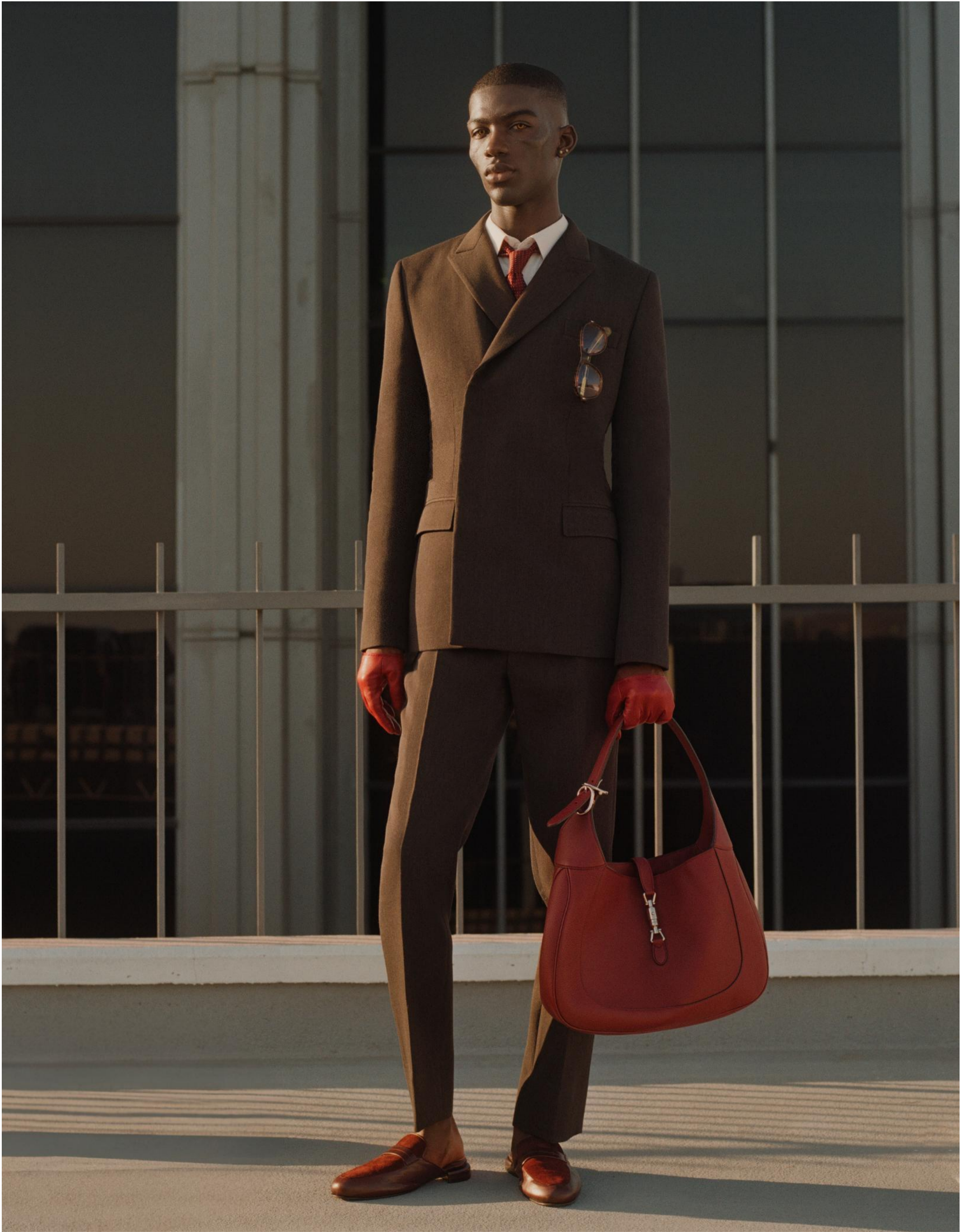
18. ALIEN PART II - NUMERO