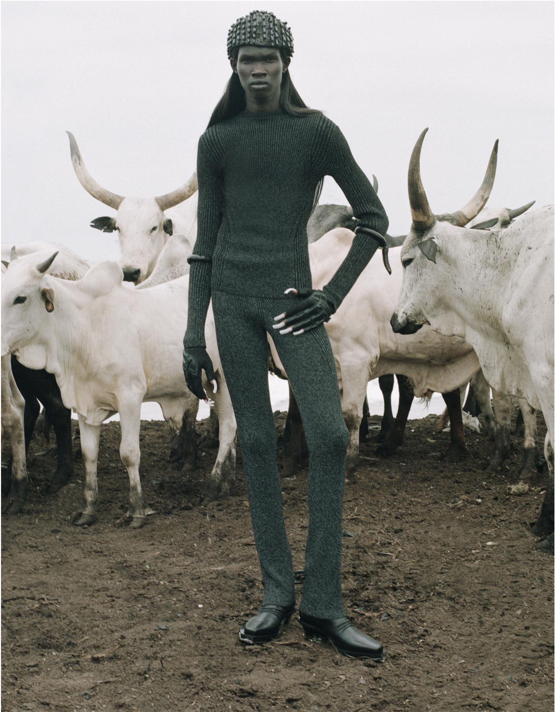
23. GHANIAN COWBOY - SSENSE