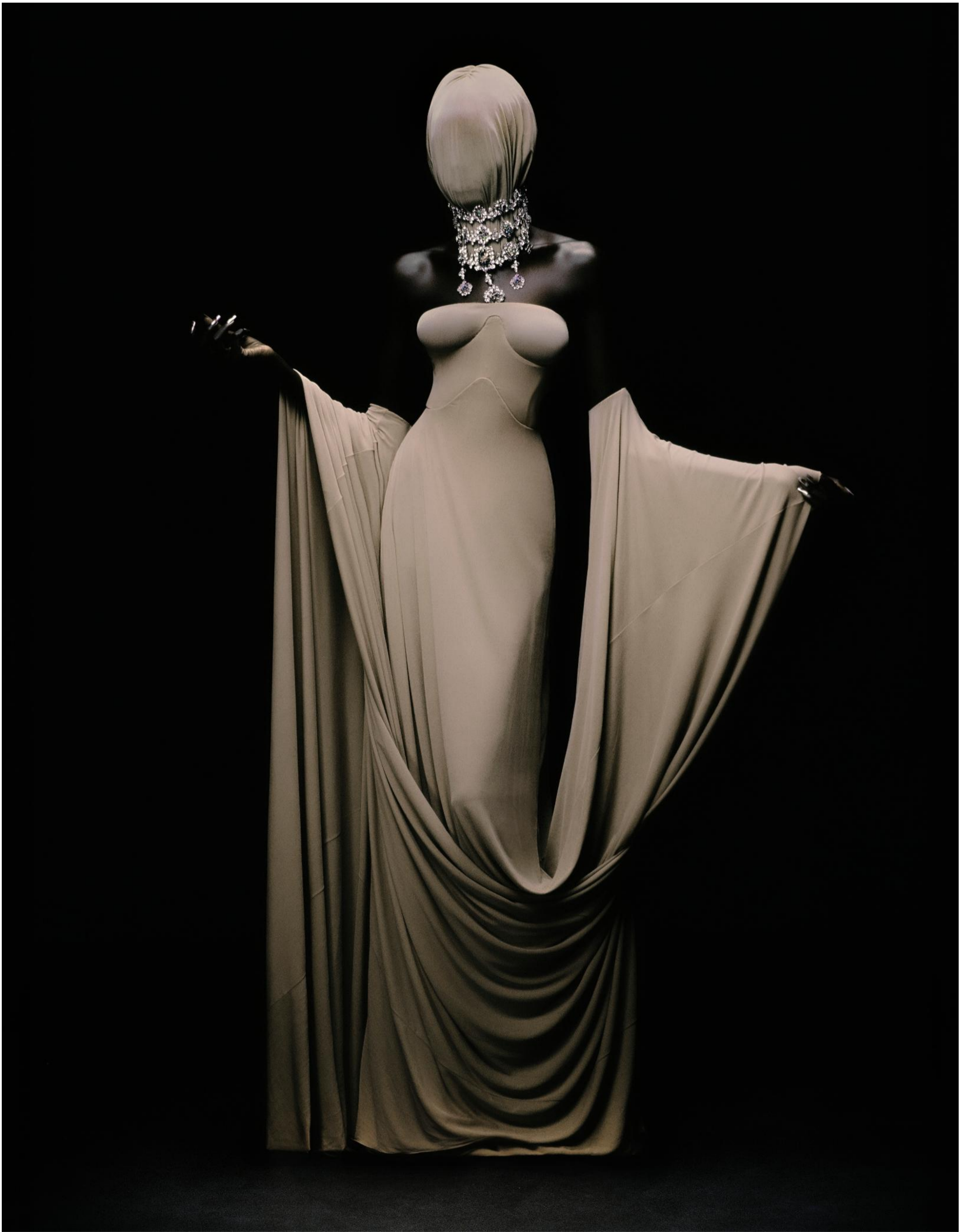
27. BOLD - ACHOL KUIR - NUMERO MAGAZINE