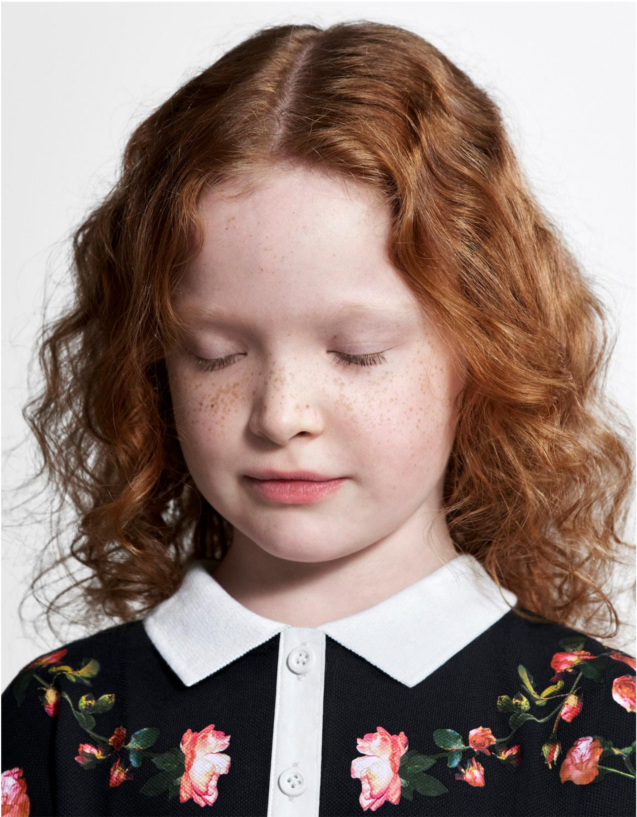
52. BURBERRY KIDS