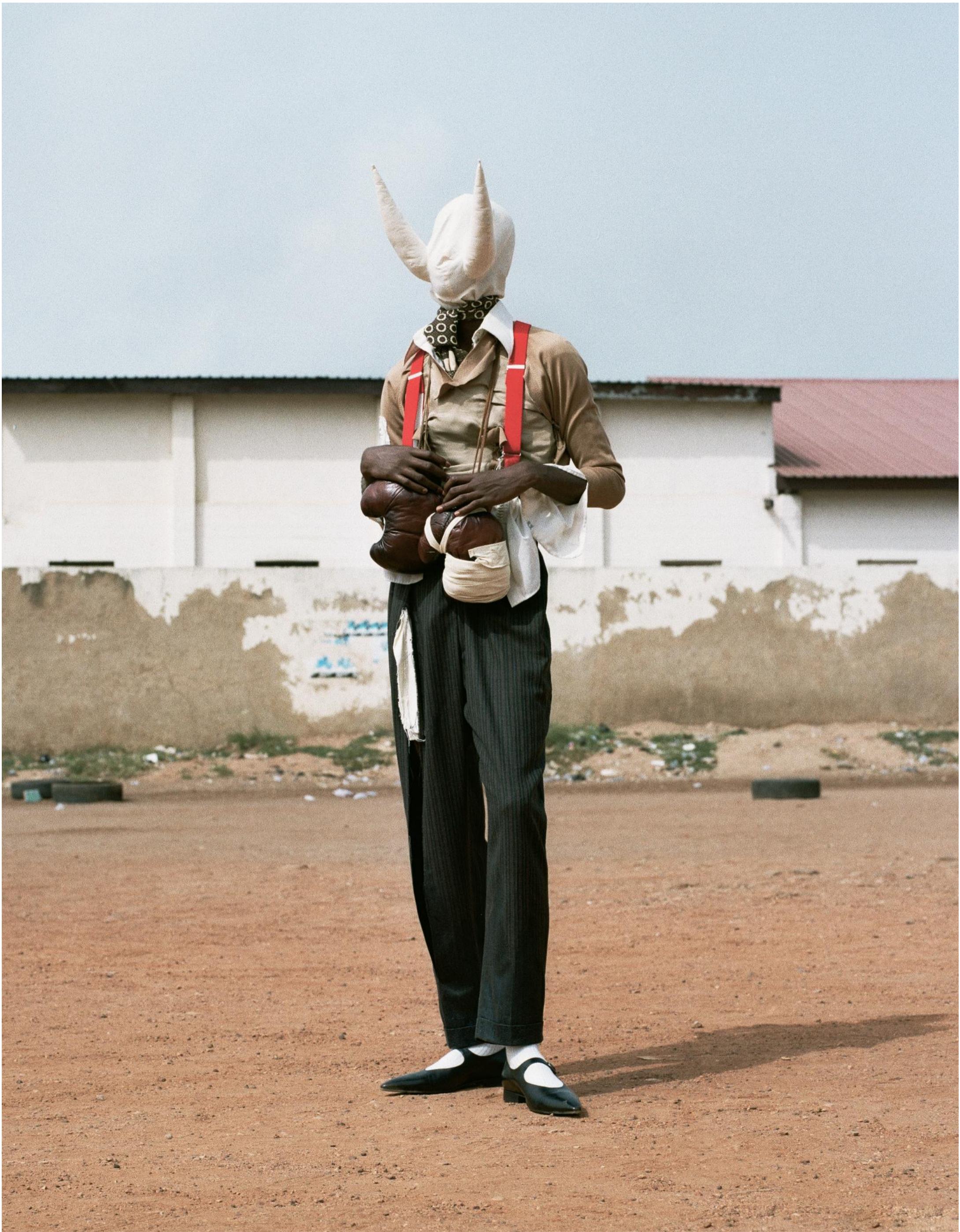
22. ACCRA'S BOXING - HIGHSNOBIETY