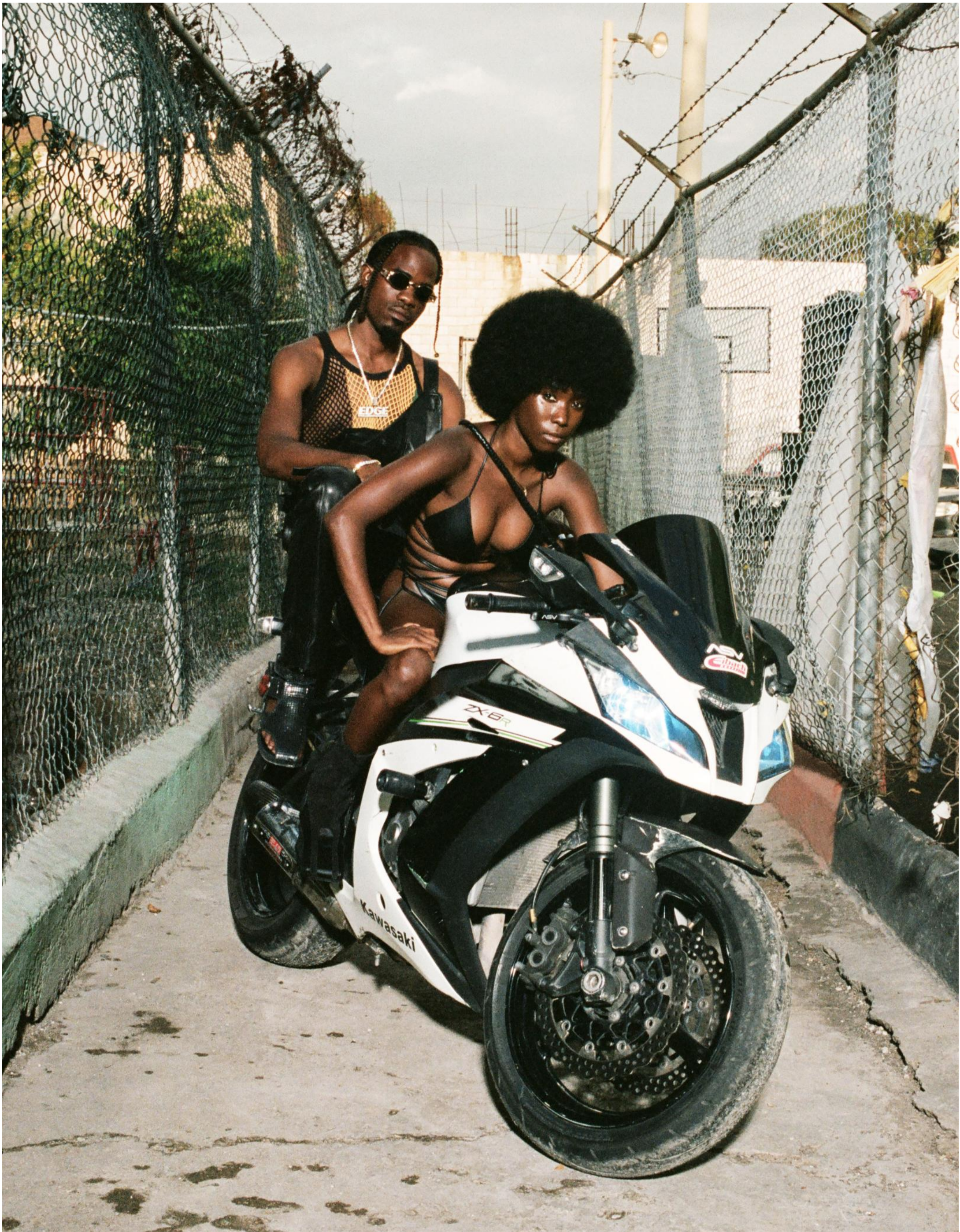
33. JAMAICAN BIKE LIFE - HIGHSNOBIETY