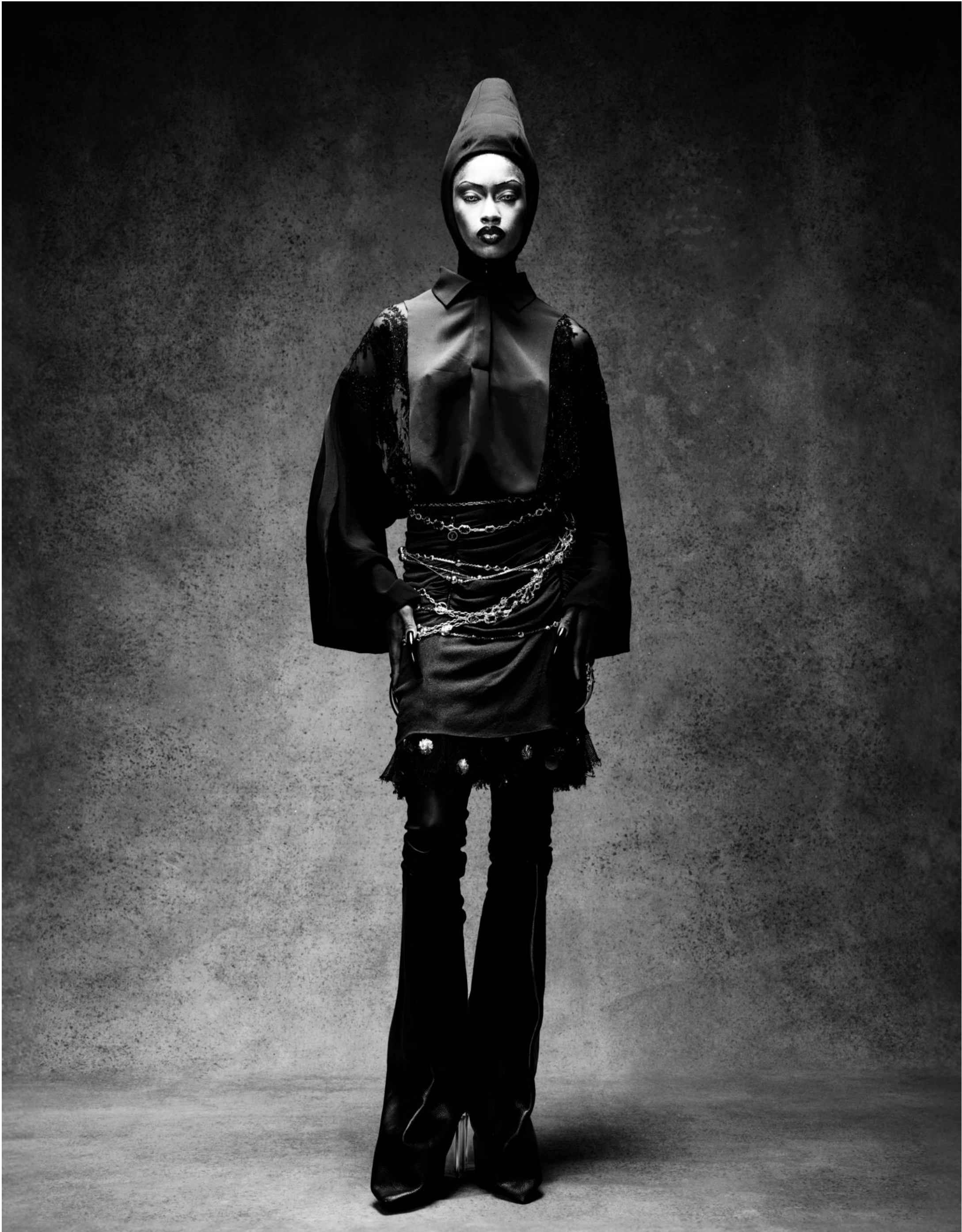
37. DIVAS - NUMERO