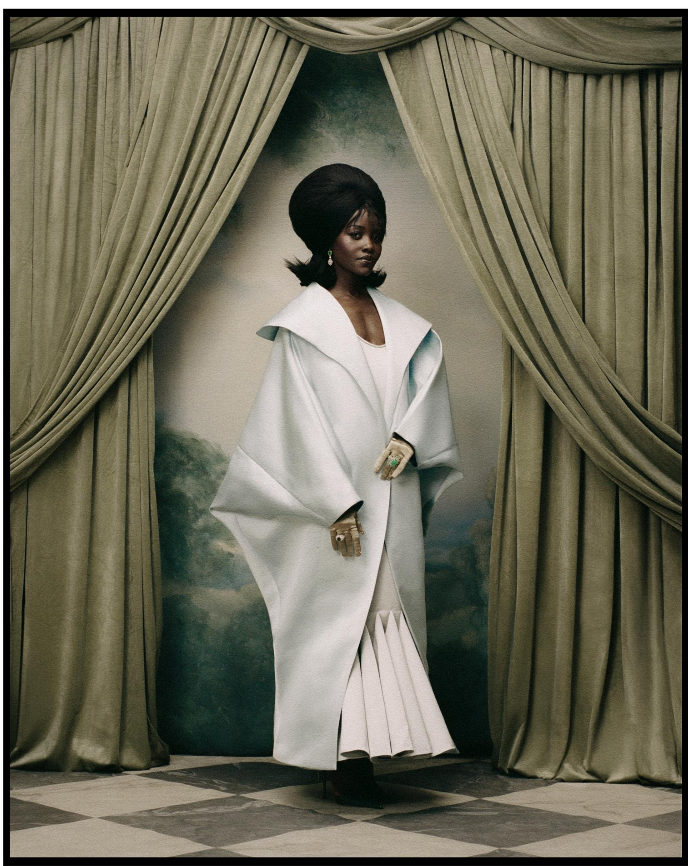
LUPITA NYONG'O- WW