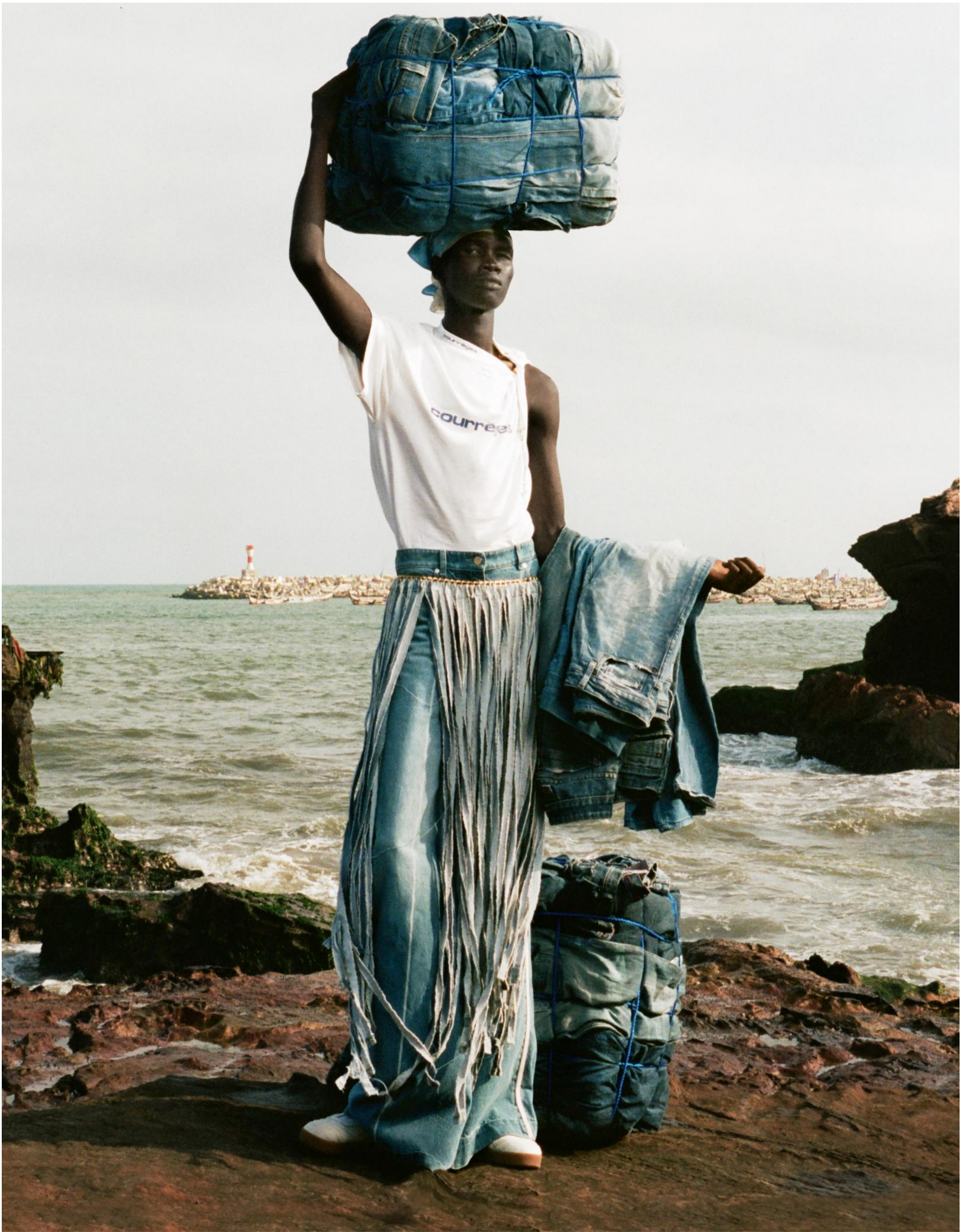
21. BEACH SELLER - NUMERO