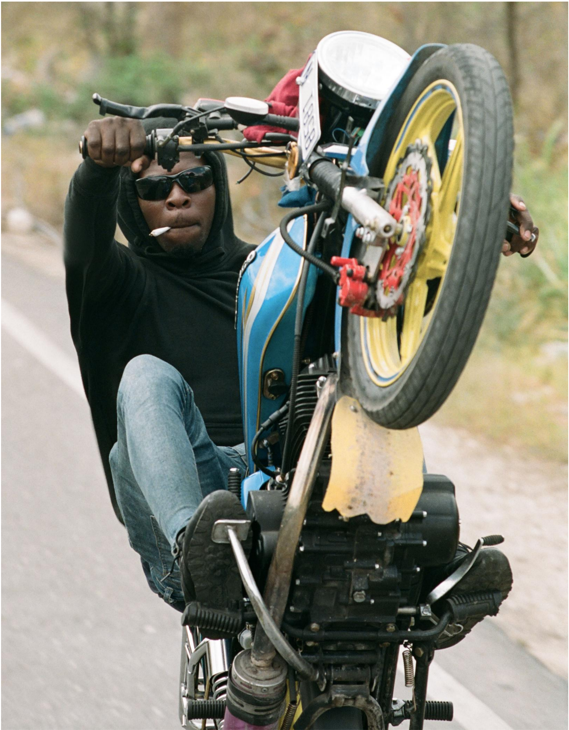
32. JAMAICAN BIKE LIFE - HIGHSNOBIETY